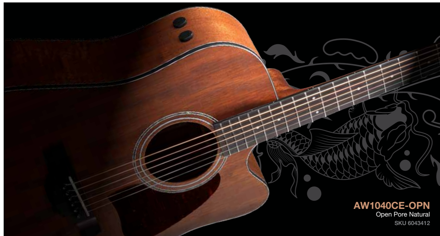
AW1040CE-OPN Open Pore Natural SKU 6043412