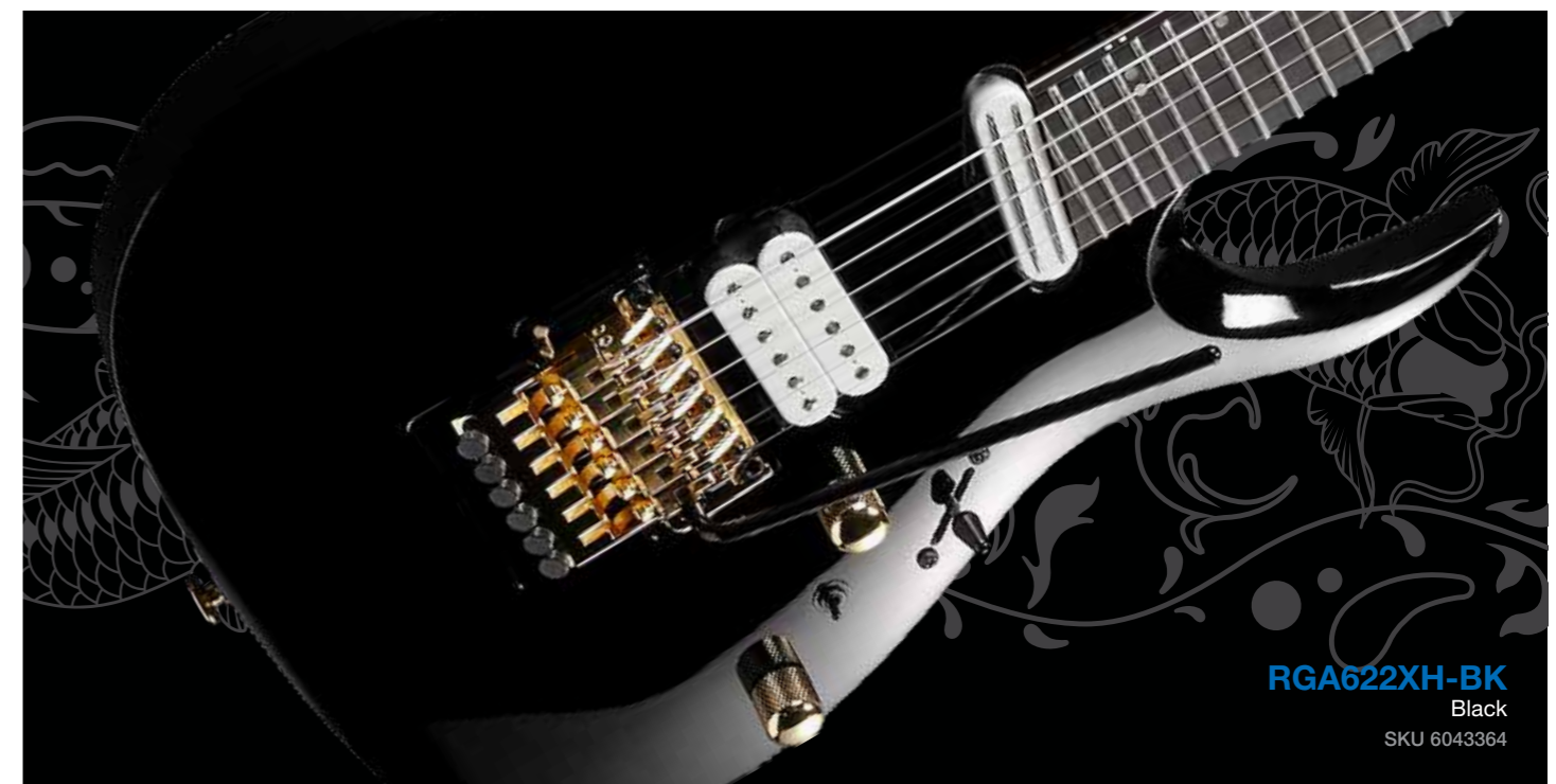
RGA622XH-BK Black SKU 6043364