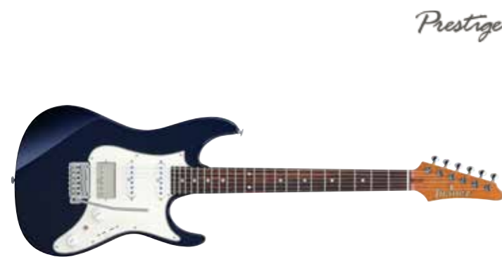
DTB Dark Tide Blue