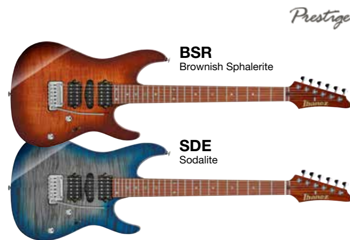
BSR Brownish Sphalerite