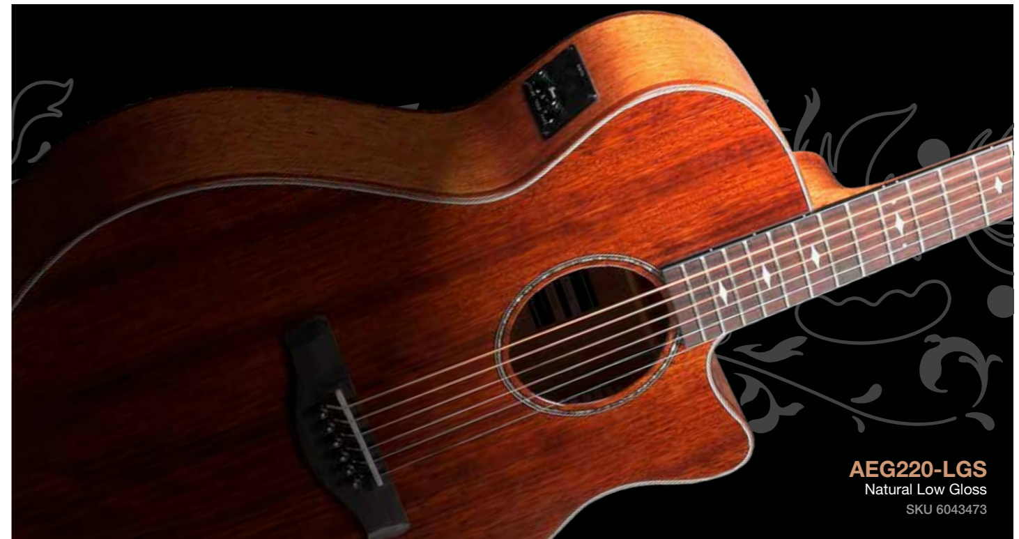
AEG220-LGS Natural Low Gloss SKU 6043473