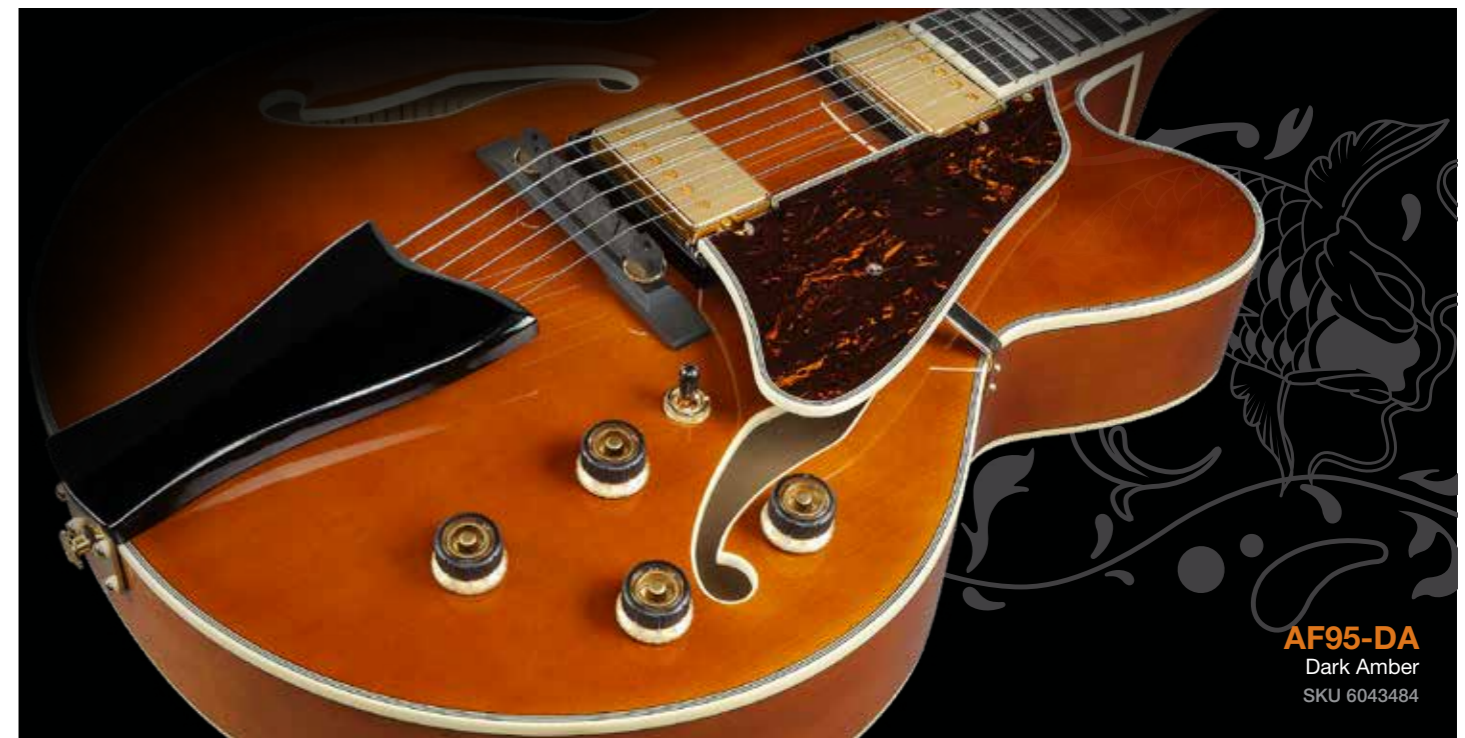
AF95-DA Dark Amber SKU 6043484