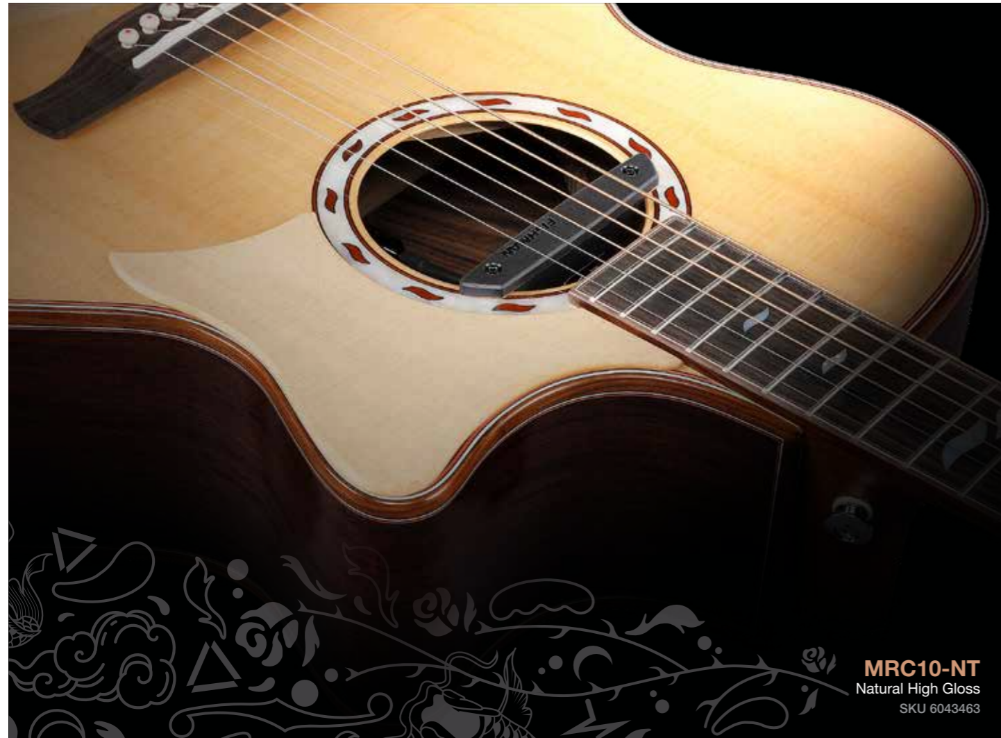
MRC10-NT Natural High Gloss SKU 6043463