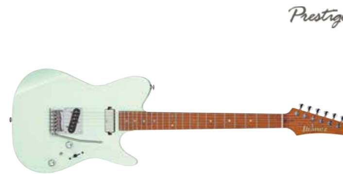
MGR Mint Green