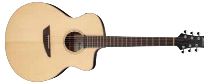
PA300E-NSL SKU 6043279