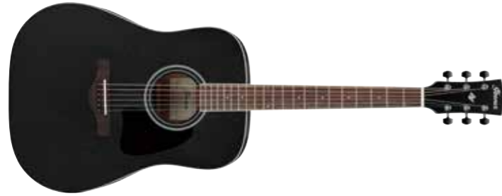
AW84-WK SKU 6043511