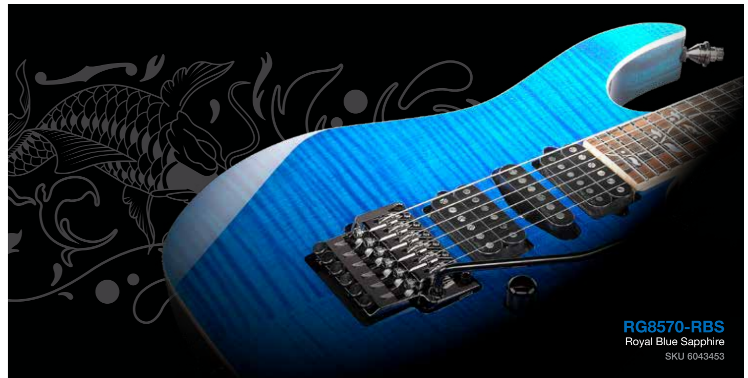
RG8570-RBS Royal Blue Sapphire SKU 6043453