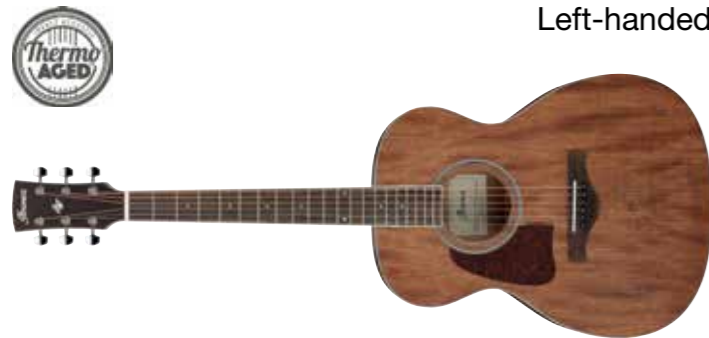
Left-handed AC340L-OPN SKU 6043512