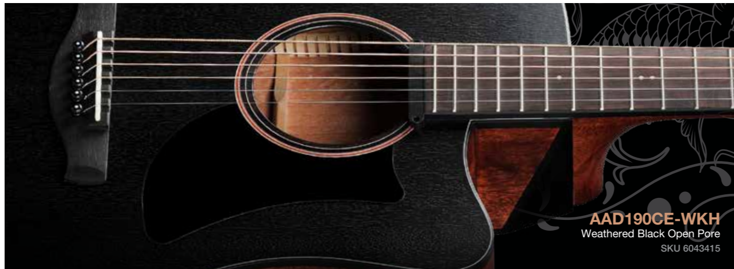
AAD190CE-WKH Weathered Black Open Pore SKU 6043415