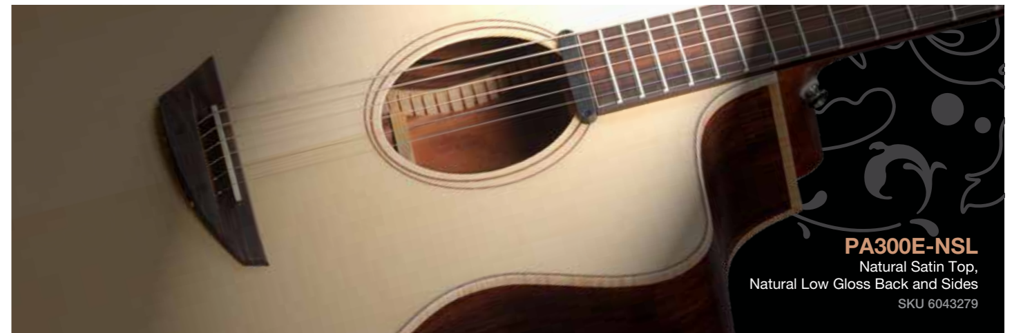
PA300E-NSL Natural Satin Top, Natural Low Gloss Back and Sides SKU 6043279