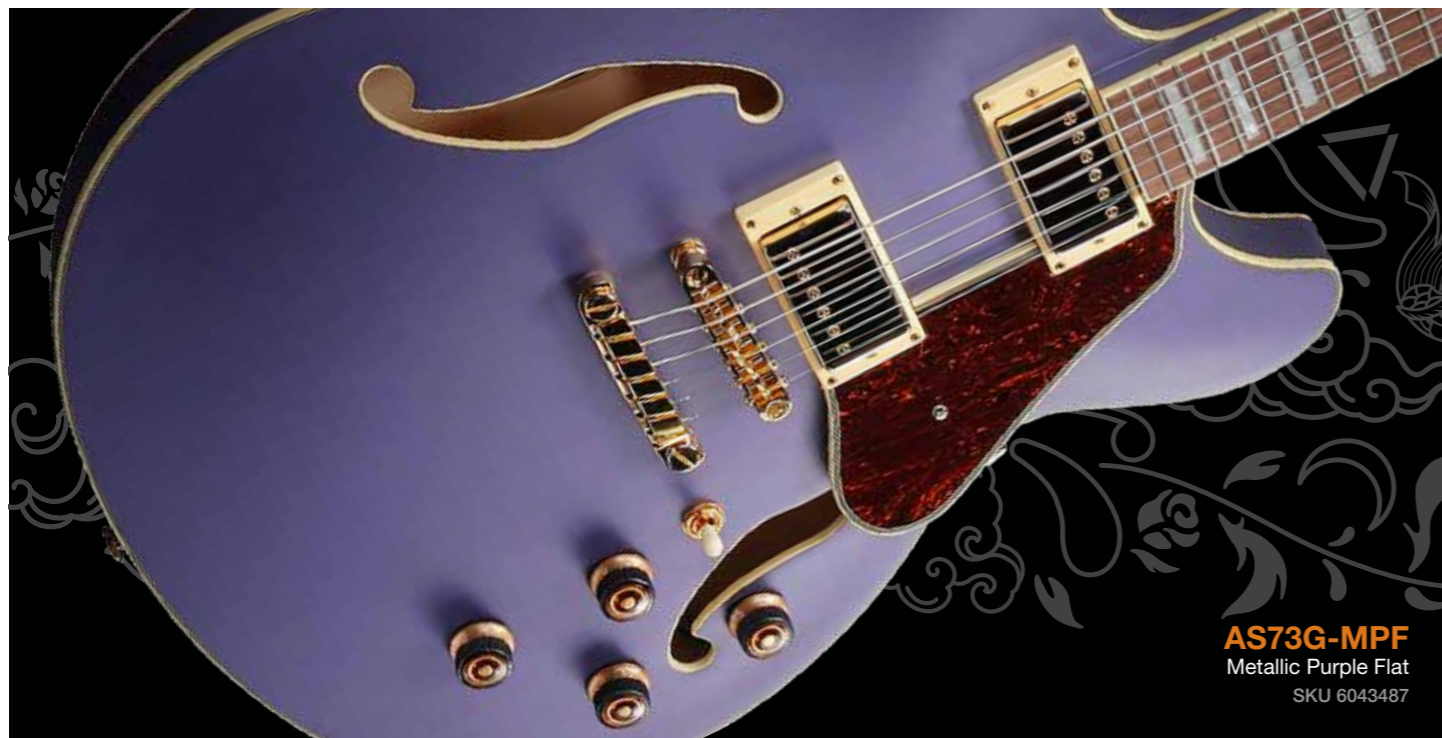
AS73G-MPF Metallic Purple Flat SKU 6043487